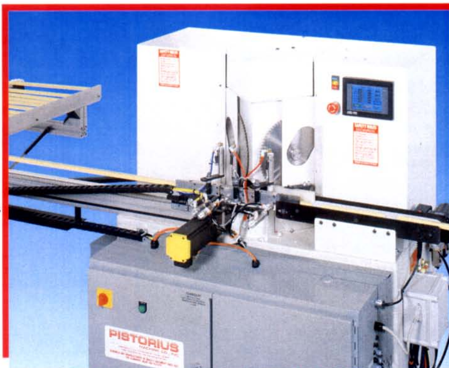
Machine shown with safety guard removed for illustration purposes

Safe and clean to operate , the machine is equipped with high efficiency sawdust exhaust ducts, low operating noise and when mitering aluminum, is available with the "PROTEX" environmentally friendly, pulse type sawblade lubrication system.